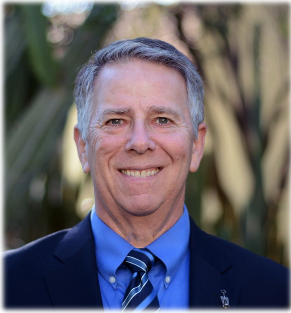
Head Shot (2023)